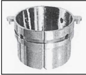
Insert Bowl No. 1